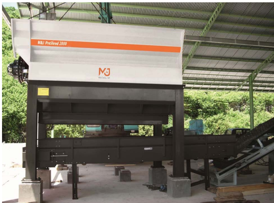
M&J PreShred 2000S