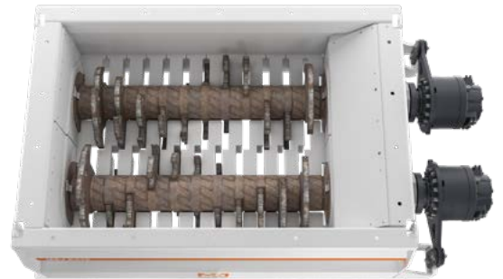
Cutting table K-210-11 knives