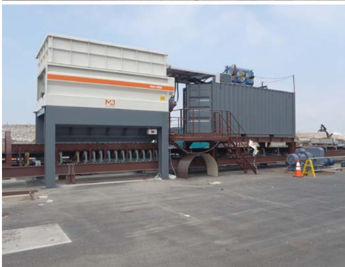
M&J PreShred 6000S