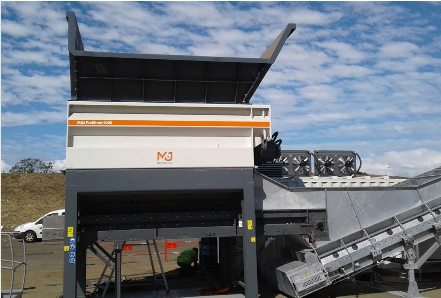
M&J PreShred 4000S