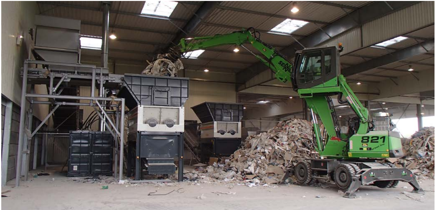
M&J PreShred 4000S

The M&J PreShred 6000 is one of the largest pre-shredders on the market, and is capable of shredding large volumes of any kind of waste. The unit is ideal when there is a need for very high capacities or for shredding material that is either extremely bulky or very heavy.