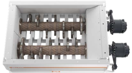
Cutting table K-210-7 knives